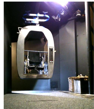
Wheelchair Adapted Car

There is one car on the Ride that has been specially adapted to accommodate a wheelchair. It cannot accommodate all types of wheelchair. The maximum size chair capacity is 65cm (chair width) X 45cm long (wheel base between axles). Also there is only room for the wheelchair on the adapted car. Therefore, a wheelchair user would be unaccompanied . Please note that electric wheelchairs cannot be safely carried on the Ride. However, we have a suitable standard-sized manual wheelchair available to which a visitor may be able to transfer.