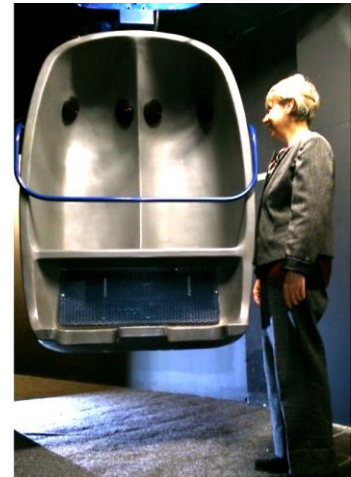
Standard Ride Car

The standard Ride car is suspended from overhead tracks. At the loading and unloading points, this is 15cm (6 inches) above the floor level. When transferring onto and off the Ride, there is a strict 25 second time limit before the car moves away automatically. While our staff can assist in steadying the car, they cannot lift people on and off.